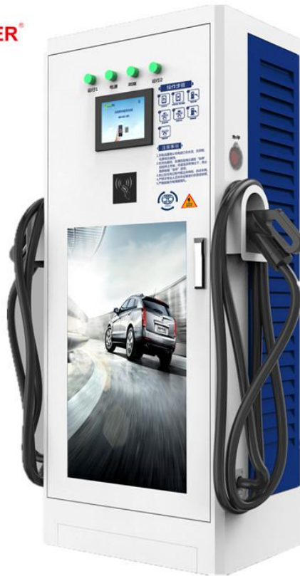
80KW Stand/Floor-type DC Charging Pile